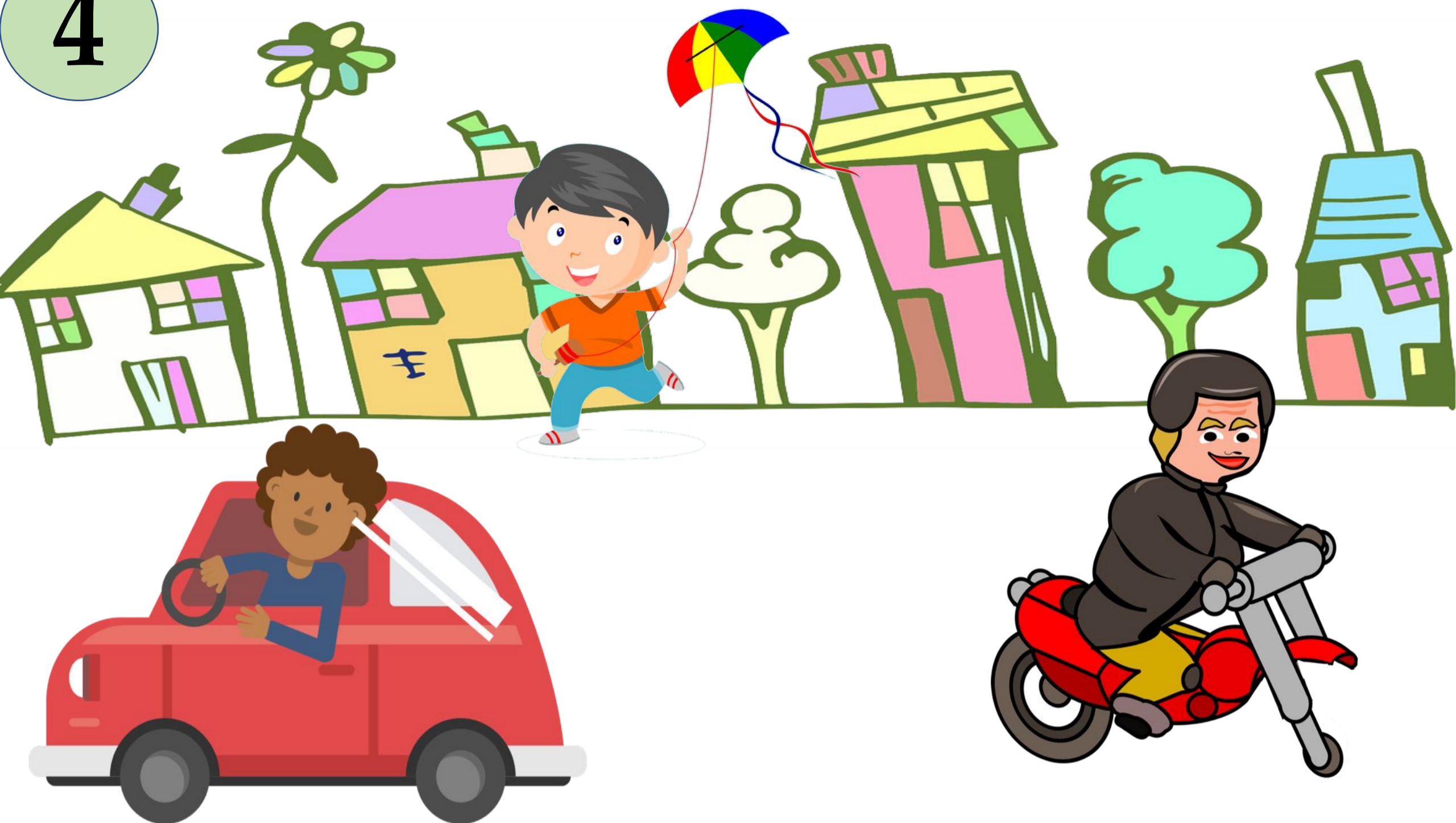
Figure out if anything is missing.