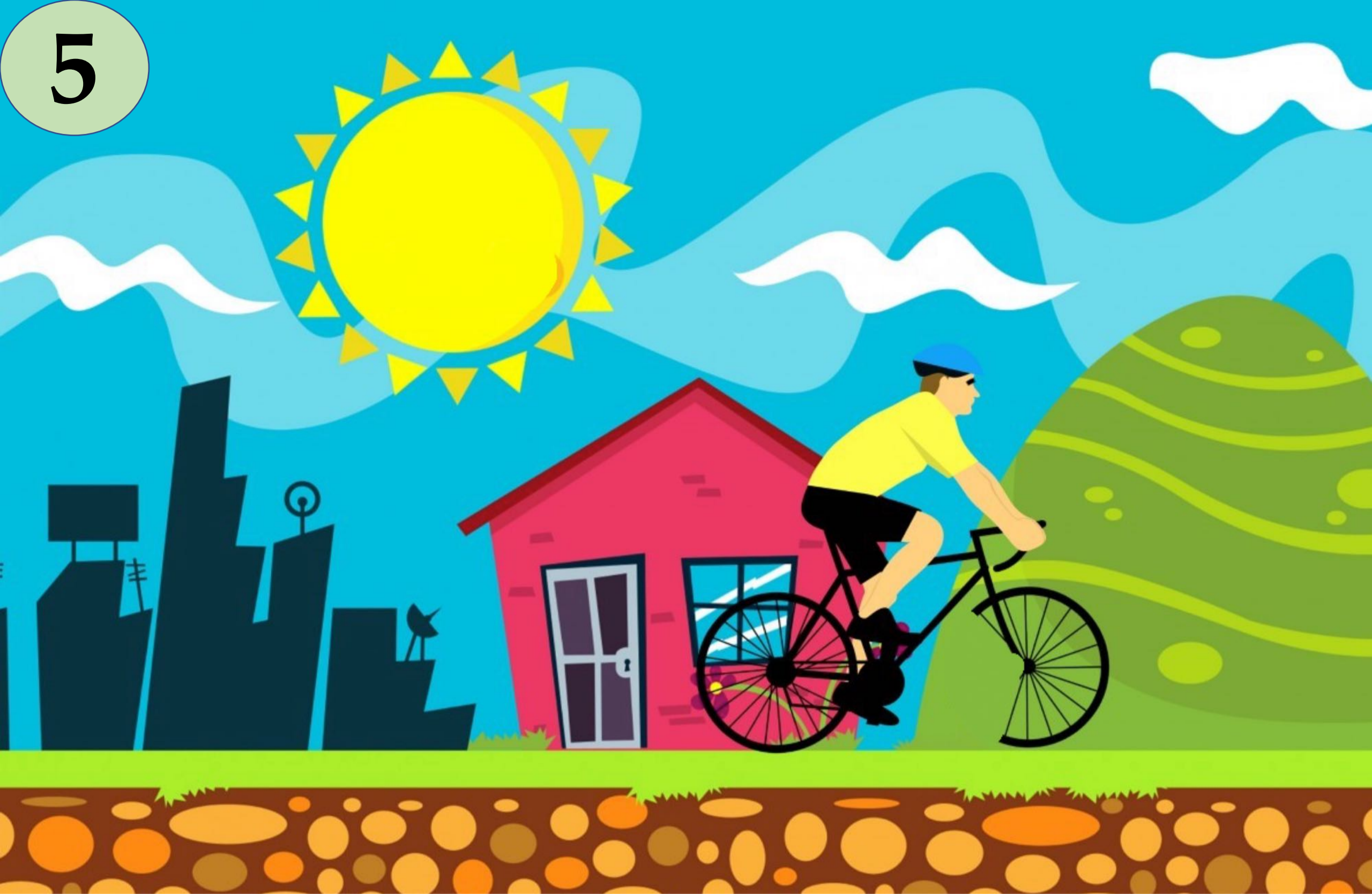
Figure out if anything is missing.